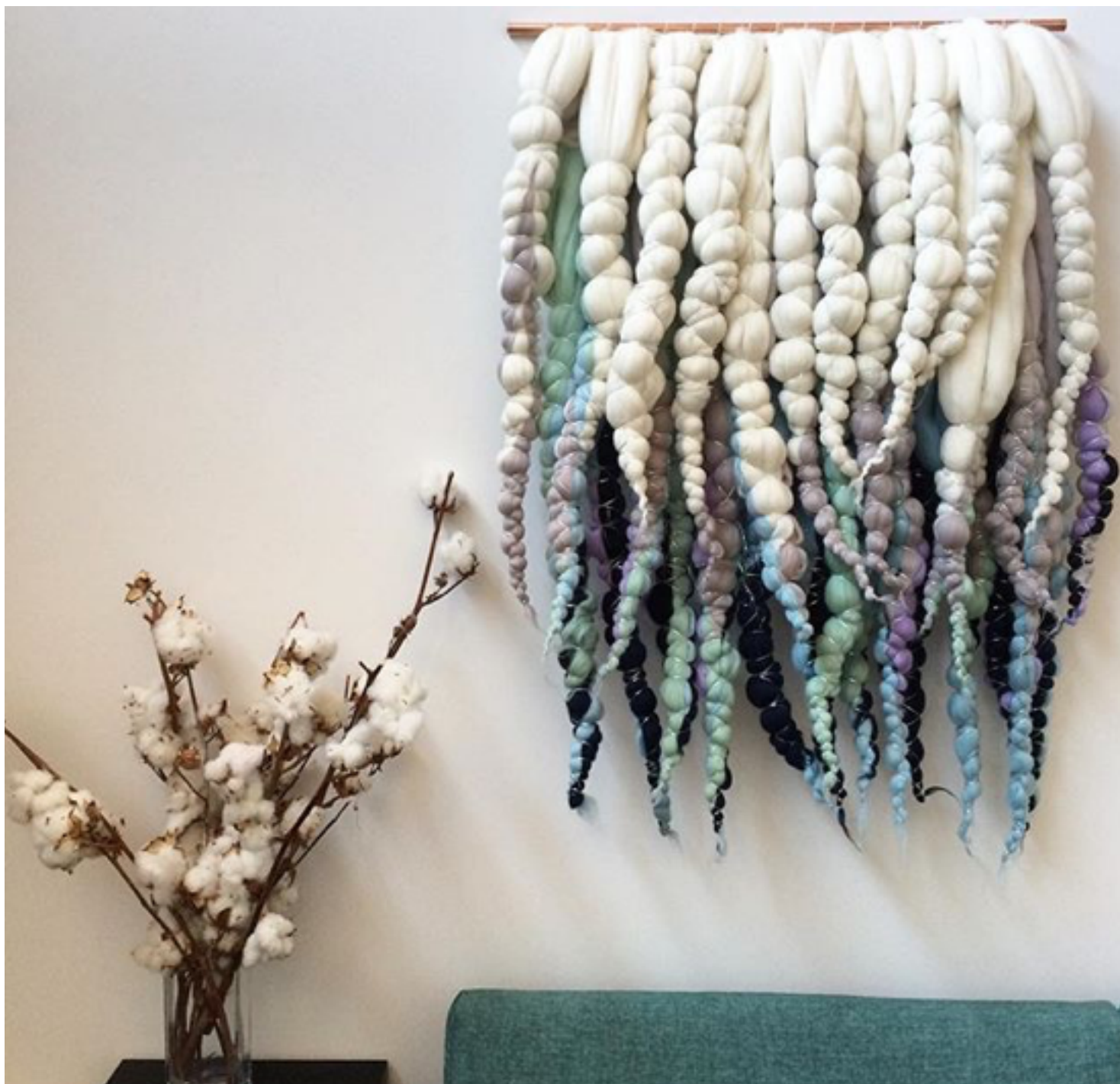
Search, 2016 wool, copper, nylon 3'x4'