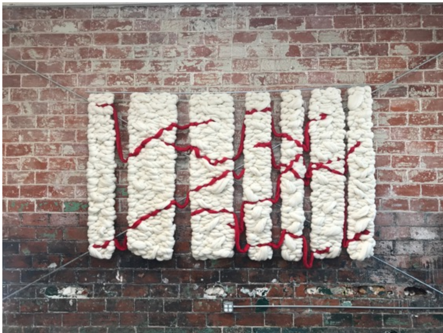
Exposed, 2017 wool and metal 10'x6'