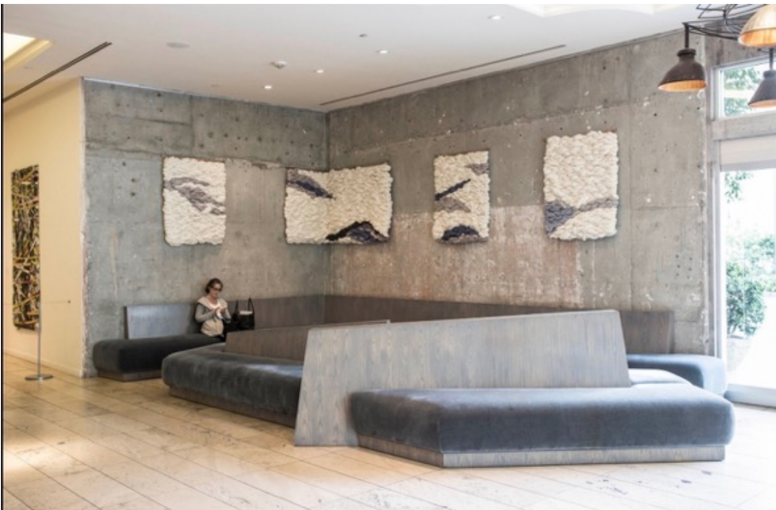
Lobby Installation, The Line Hotel, 2017 wool and copper 3'x4' 8' x 4' 3'x4' 3'x4'