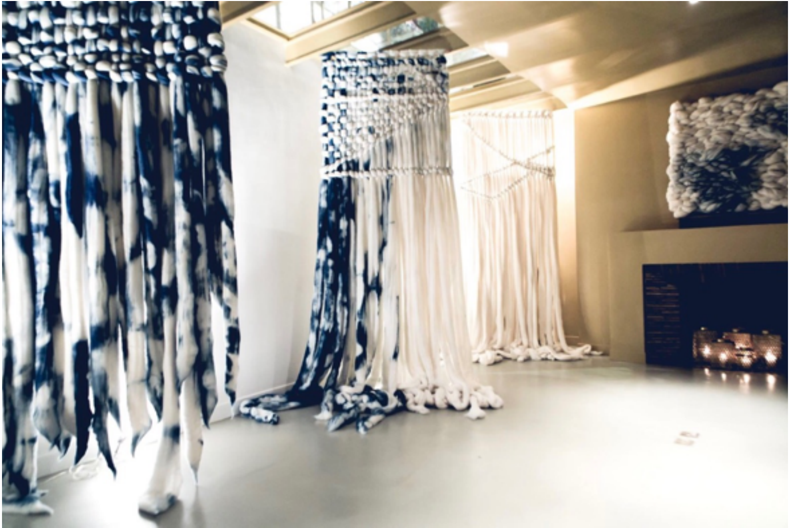
The Artisans, 2016 wool and copper 3 pieces, each 4' x 15'