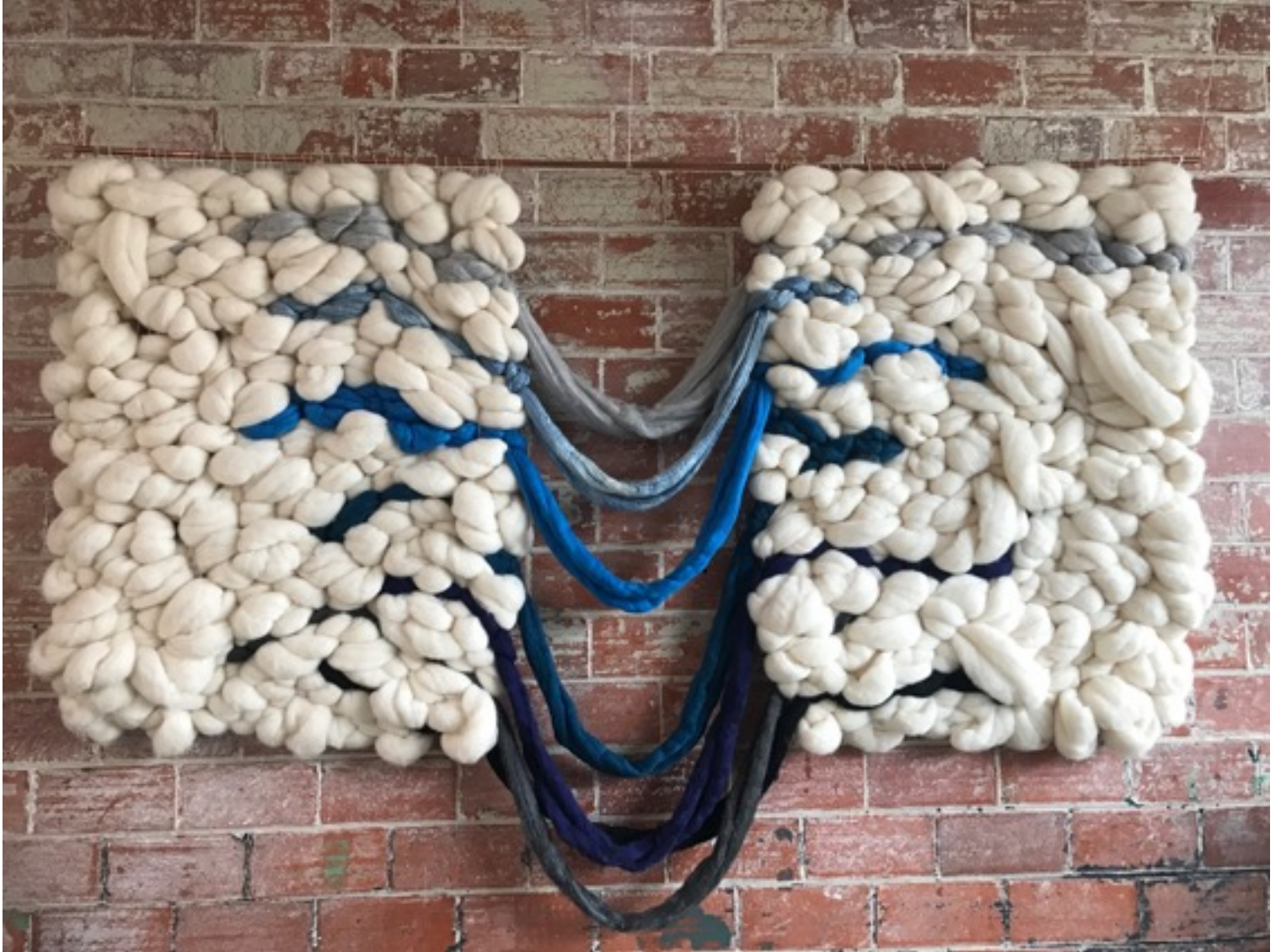
Separation, 2015 wool and copper 9'x5'