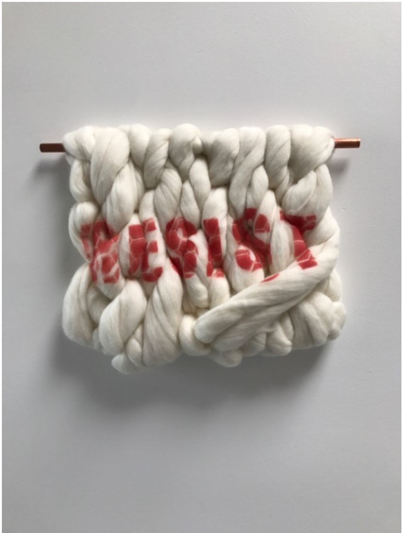
Resist, 2017 wool, ink, copper 17" x 17"