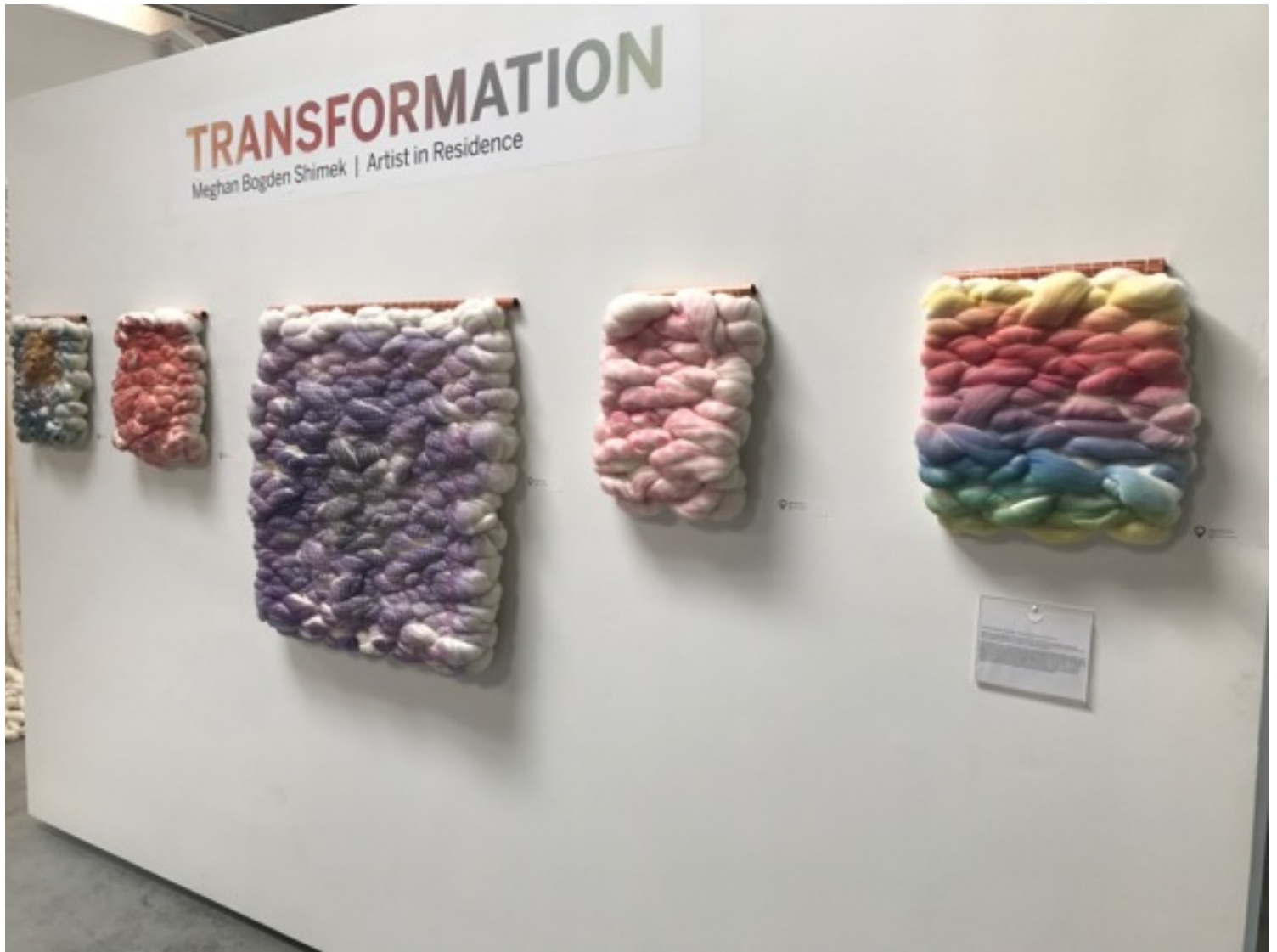
Transformation, 2017 wool, ink, copper 17"x17" 17"x17" 36" x 36" 17"x17" 17"x17"