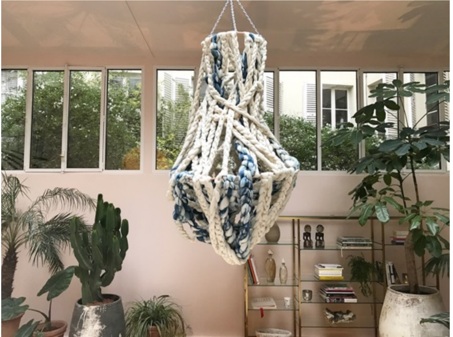
Chandelier, 2016 wool and copper 6' x 4' diameter