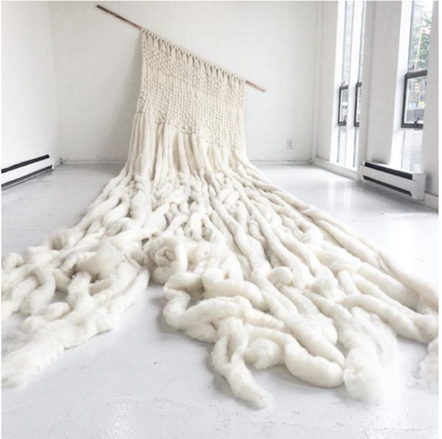
Wave, 2015 wool and copper 4' x 20'