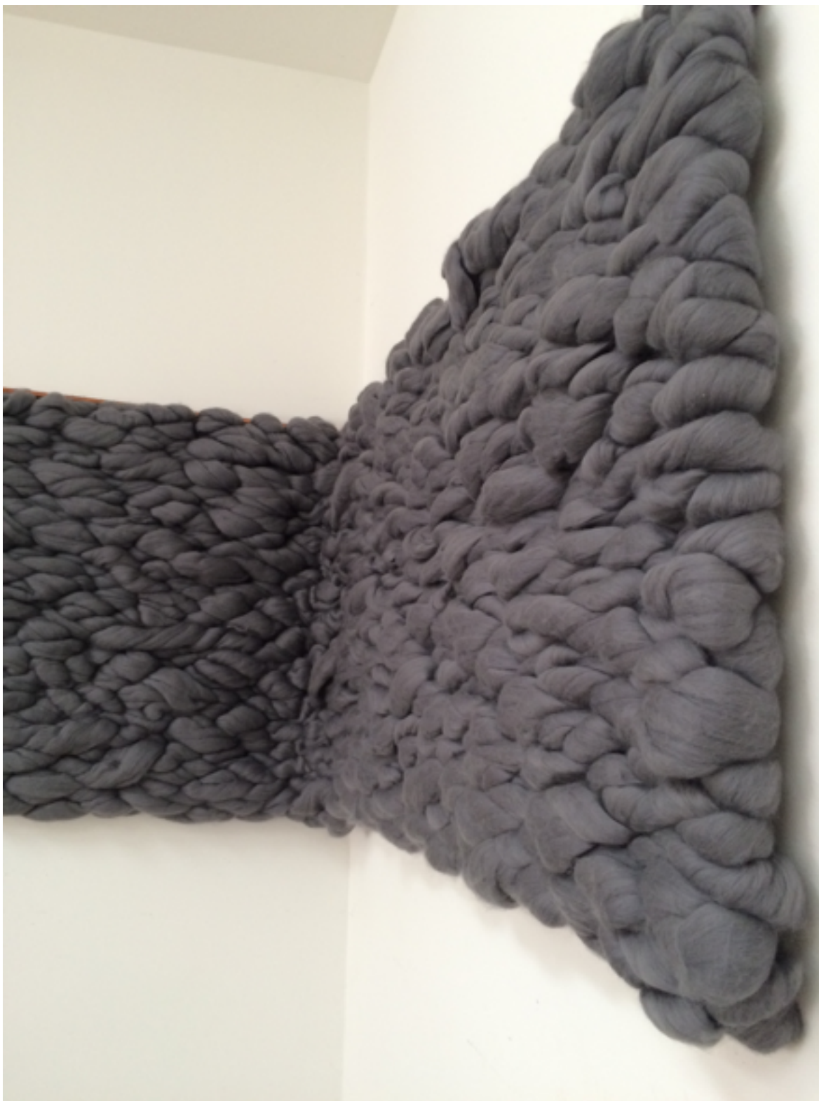
Shadow, 2016 wool on copper 10' x 3'