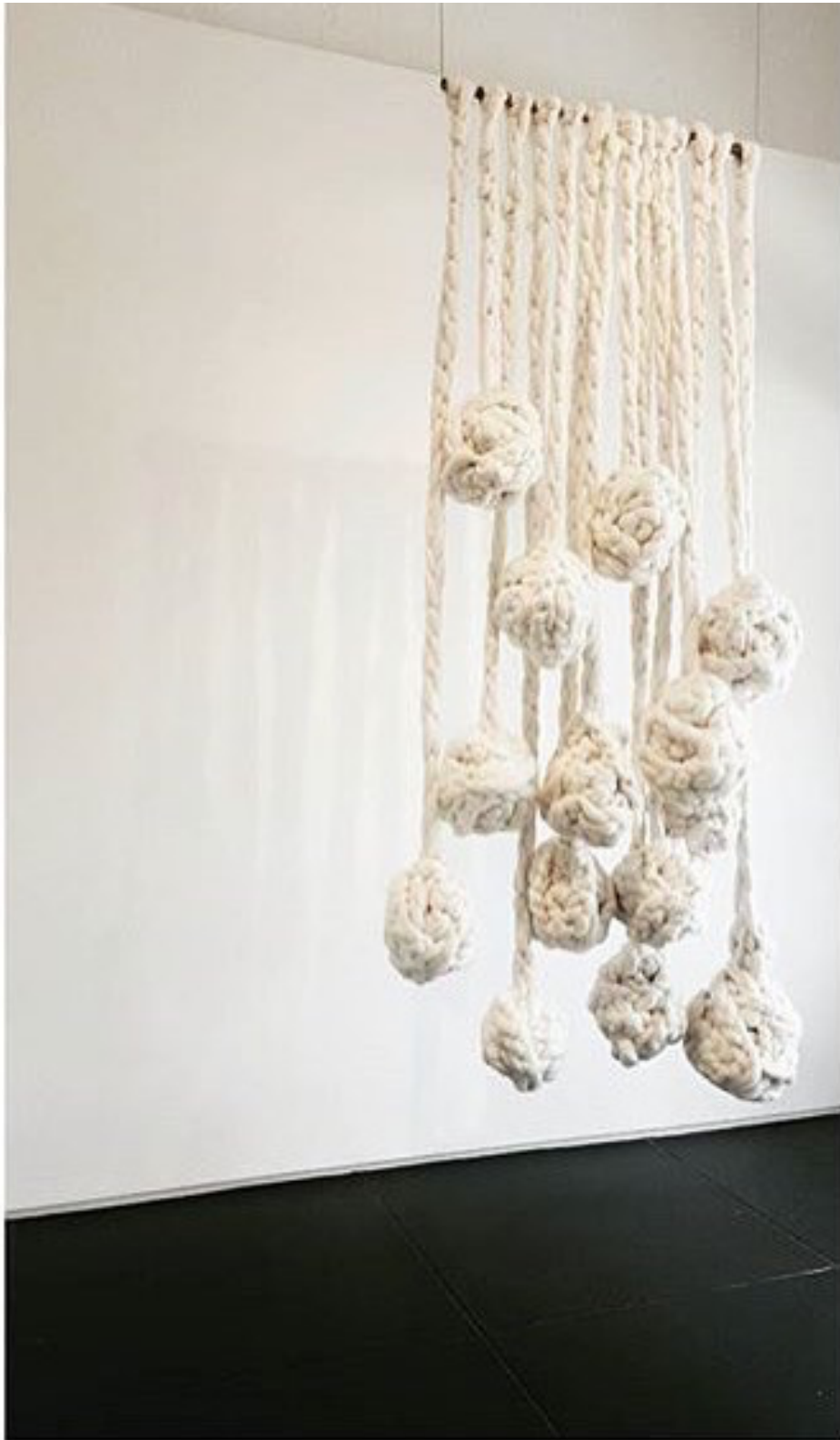
Bump , 2016 wool and copper 4' x 8'