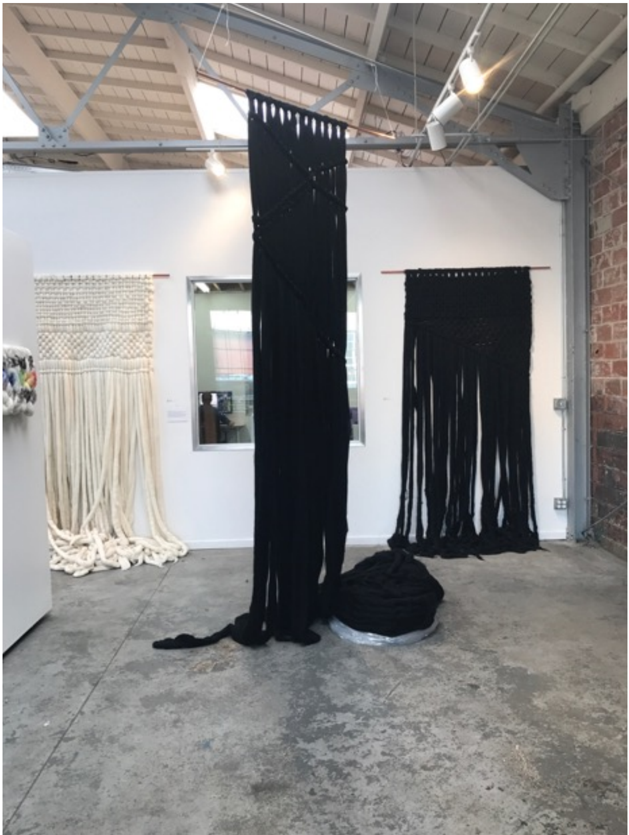
Local Language, 2017 wool and copper