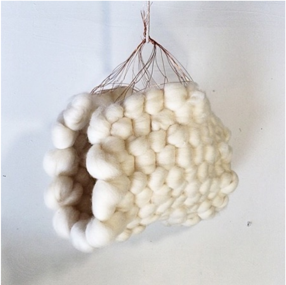
Contain, 2014 wool and copper 30" x 16"