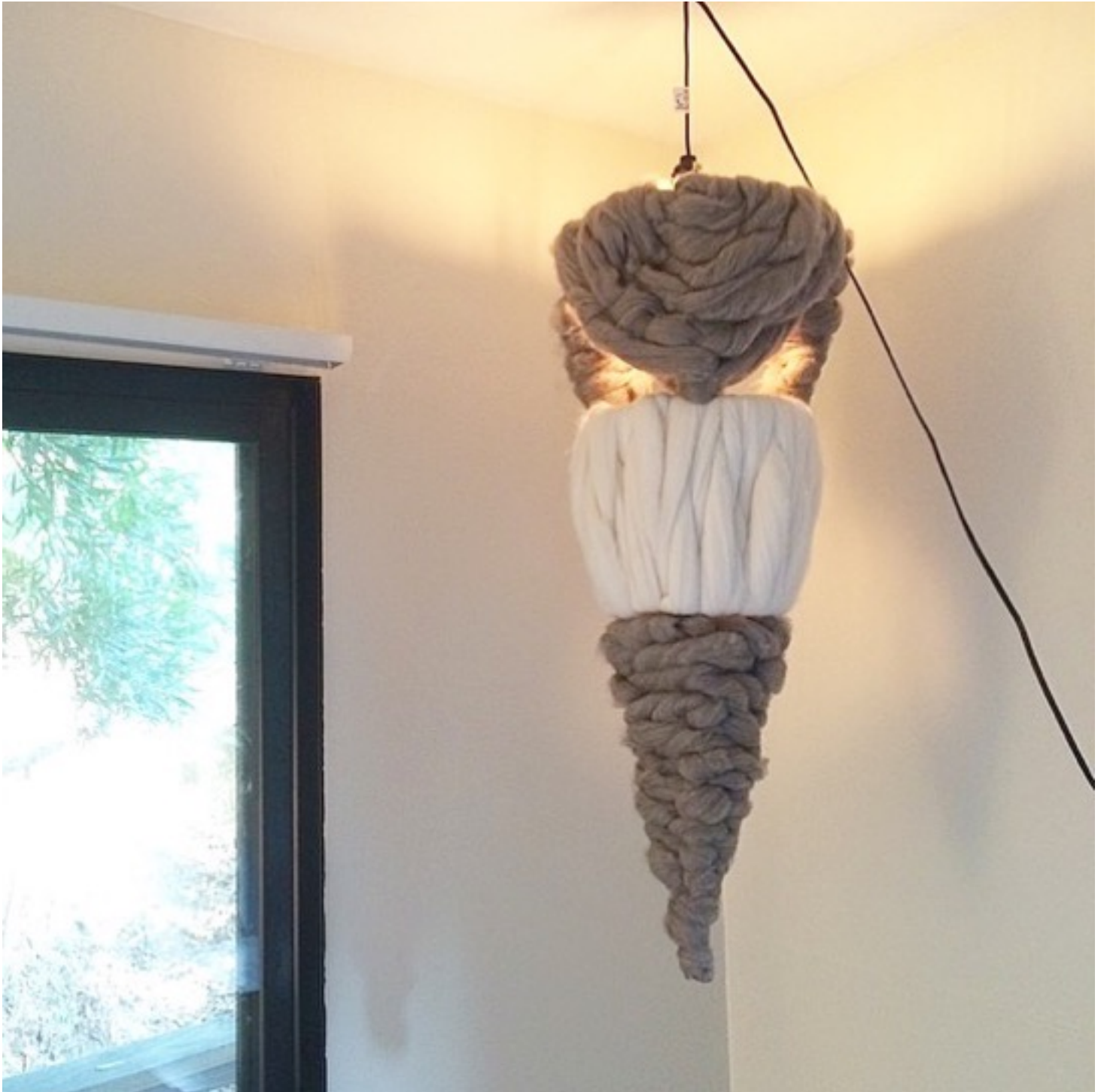
Light, 2014 wool and metal 4' x 1' diameter