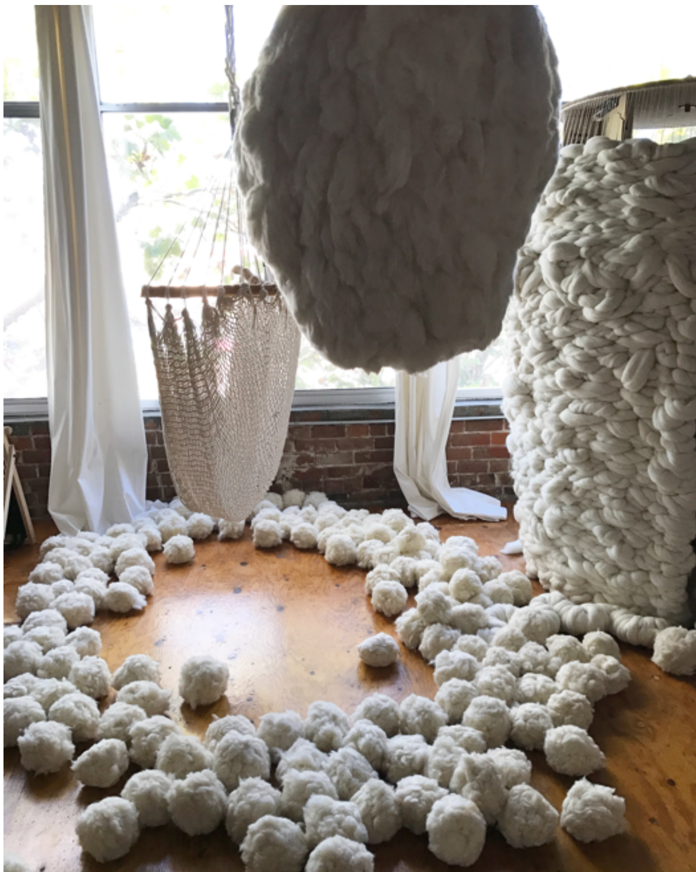
Studio view, 2016 wool