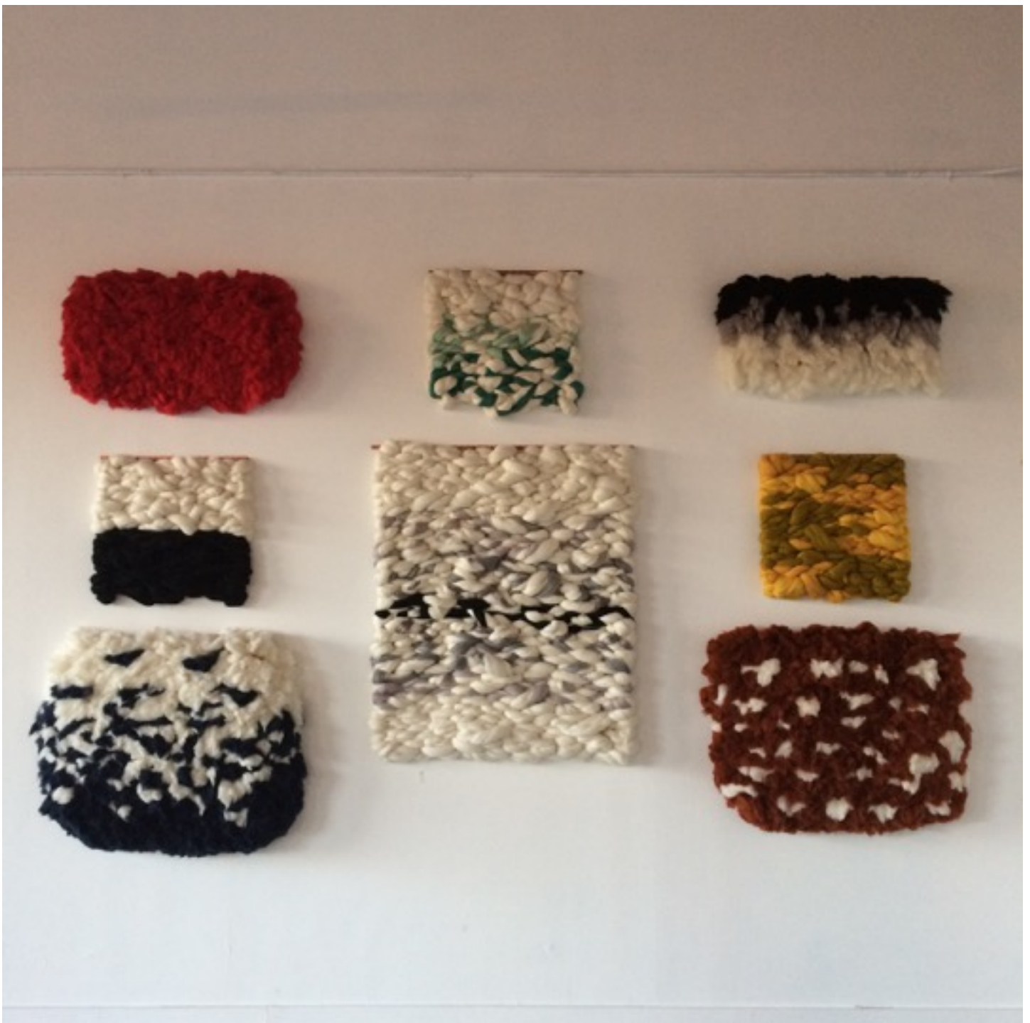
Selection of work, 2016 wool and copper

Please visit www.meghanshimek.com for more images and http://www.apartmenttherapy.com/house-tour-a-fiber-artists-textured-oakland-loft-235122 to see views of my current live/work studio space