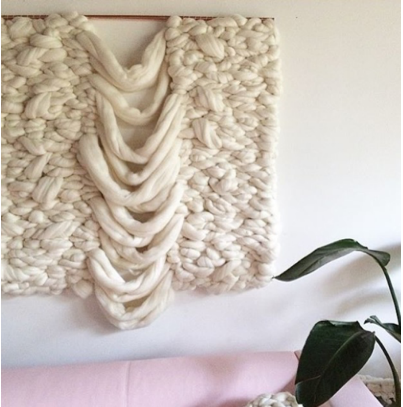
White Noise, 2016 wool and copper 5' x 4'