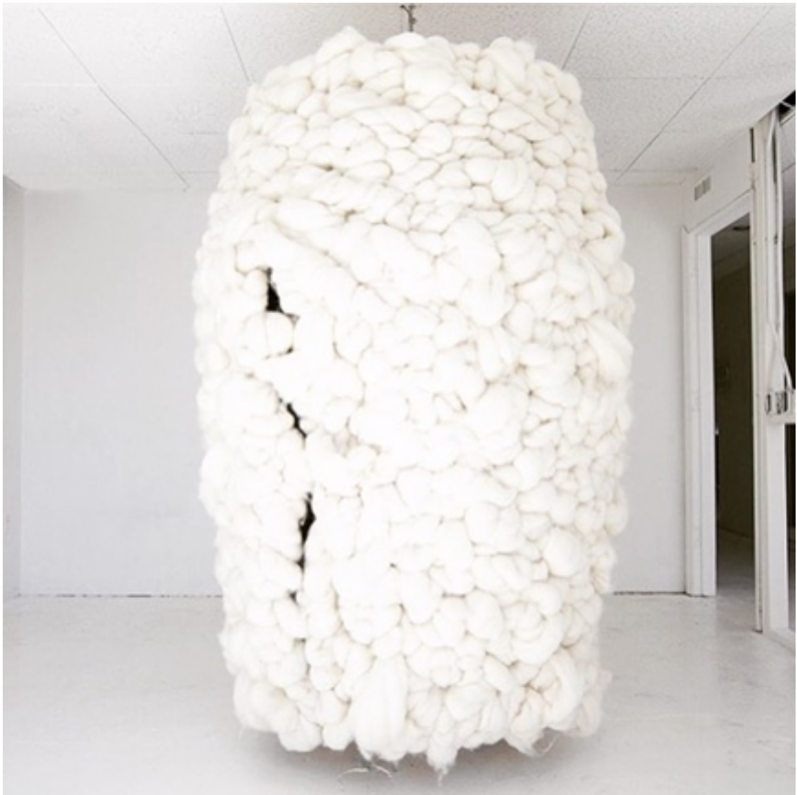
Cocoon, 2015 wool and wood 6' x 4' diameter