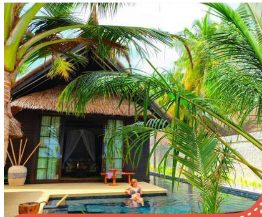
Jumeirah's private beach villas - Maldives