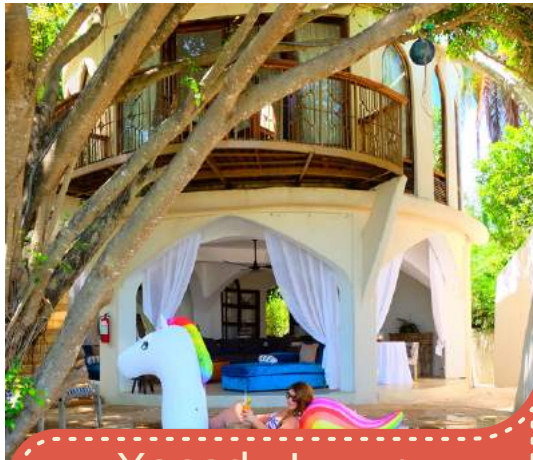
Xanadu Luxury Resort Zanzibar