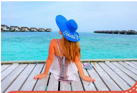
Jumeirah Luxury Resorts