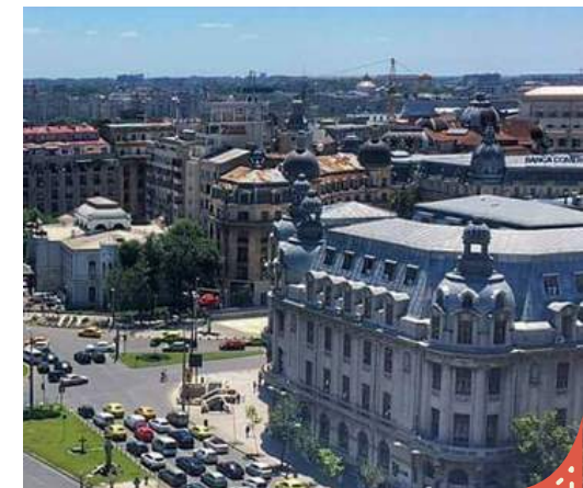
Intercontinental Hotel Group