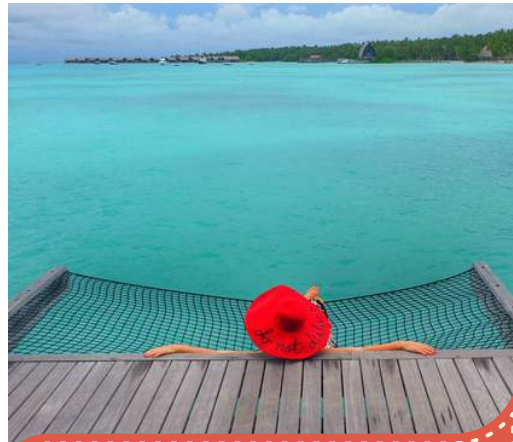
Shangri-La Luxury Resorts