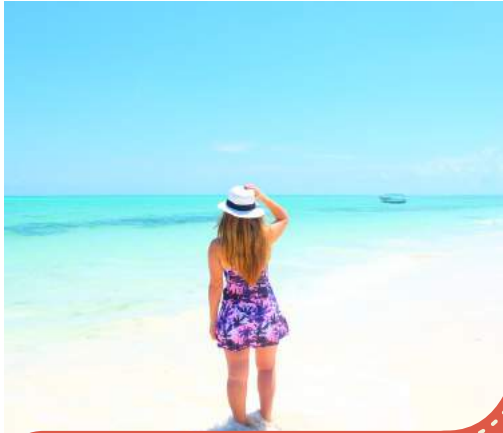
Zanzibar Tourism Board