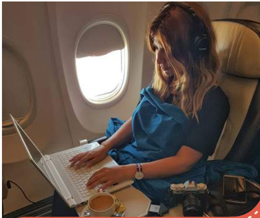
Promoting Fly Dubai's business class flights to tropical destinations