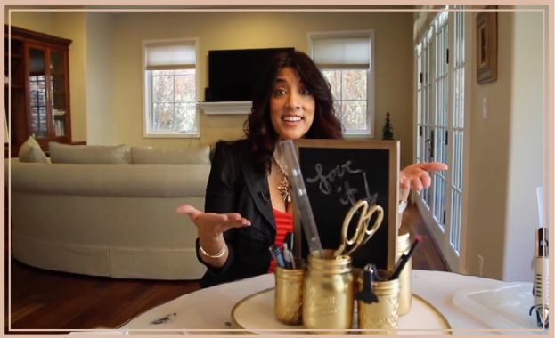
Lazy Susan Desk Organizer