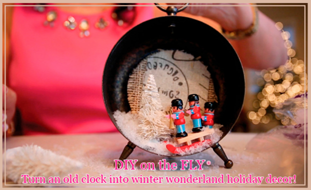
Old Clock Holiday Decor