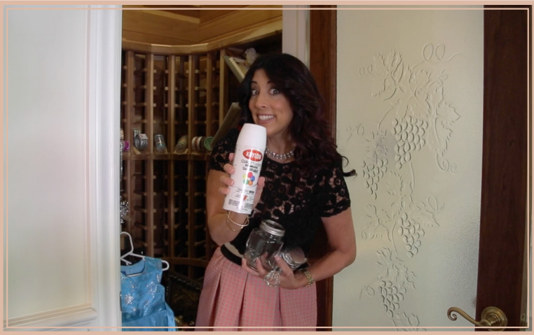
The Crazy Craft Closet A Pickle jar & Spraypaint?