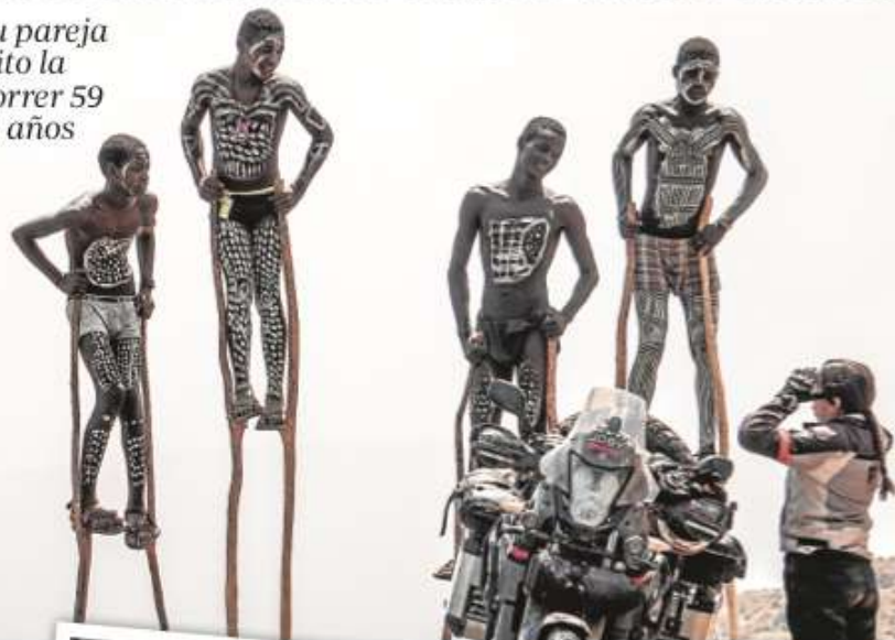
Los viajeros cuentan su experiencia en el proyecto liderado por Around Gaia

Un sevillano y su pareja realizan con éxito la aventura de recorrer 59 países en cuatro años