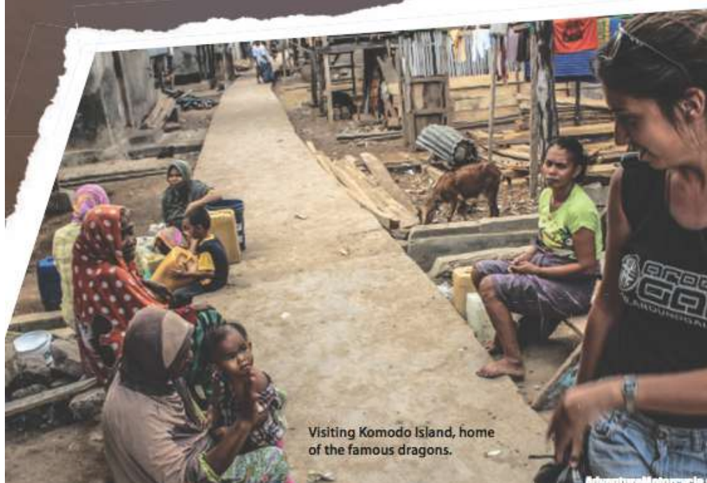
Visiting Komodo Island, home of the famous dragons.

It was one of the highest sections of the Tajikistan's Pamir mountain range, on a dangerously icy road that kept us on our toes. There'd been plenty of warnings not to challenge the mid-November forces of nature as this mountainous region had little respect or mercy for travelers. Although the going was expected to be tough, slogging through a snowstorm while facing -20°C temps turned out to be far more harrowing than we ever imagined. Then at 5,000 meters the nose bleeds started, forcing us to somehow find shelter before nightfall. Severely dazed and confused by the conditions and altitude, having no GPS or maps, and immersed in darkness to a point where we couldn't see the road, we were barely able to crawl along at 10 kph. This was the first time ever that traveling the world by motorcycle sucked!