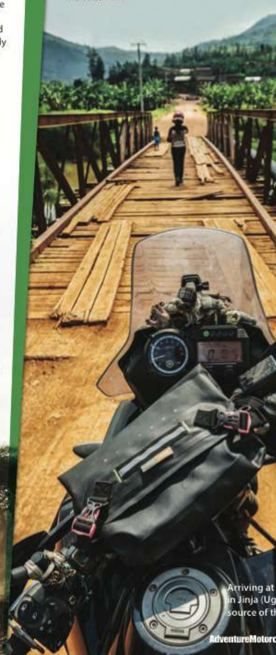
Arriving at the source of the Nile in Jinja (Uganda)

There are many rivers in the world, but none as long as the Nile—the longest on Earth. Born on Lake Victoria in the city of Jinja, the river begins a spectacular trek across the Sahara, the driest region of the planet en route to the Mediterranean Sea—a journey that takes months. ADV