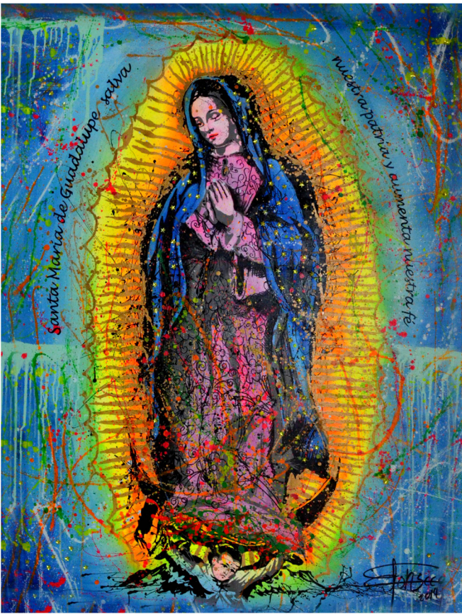
Title: La morenita Painting : Water Acrylic & Oil Acrylic on Canvas Year: 2014 Measures: 47 x 62 in. SOLD