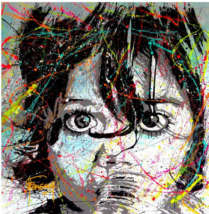
Title: Mary Jane Painting : Water Acrylic & Oil Acrylic on Canvas Year: 2015 Measures: 47 x 47 in. SOLD