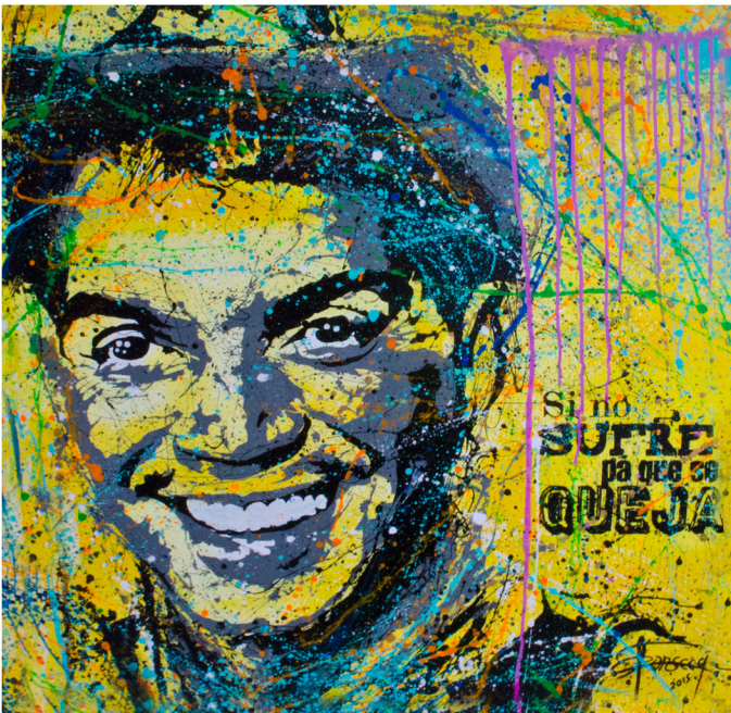
Title: Cantinflas Painting : Water Acrylic & Oil Acrylic on Canvas Year: 2016 Measures: 39 x 39 in. SOLD