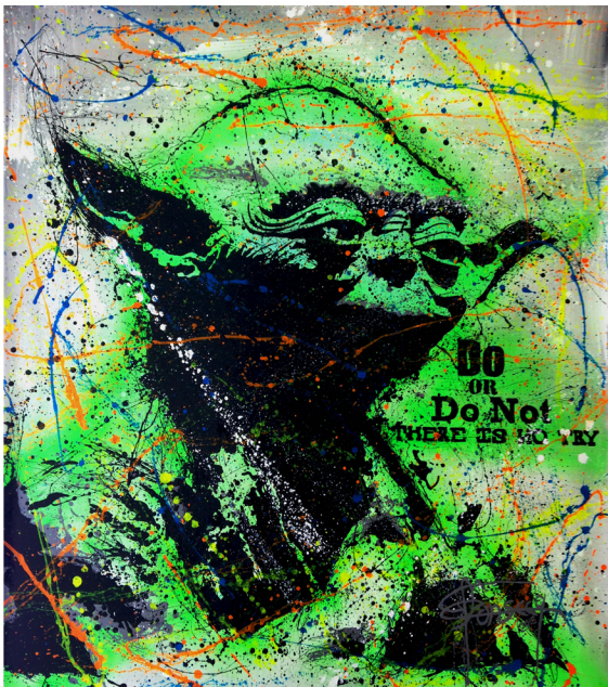
Title: Do or do not Painting : Water Acrylic & Oil Acrylic on Canvas Year: 2016 Measures: 39 x 39 in. SOLD