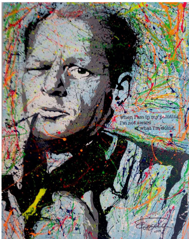
Title: Pollock Painting : Water Acrylic & Oil Acrylic on Canvas Year: 2015 Measures: 43 x 55 in. AVAILABLE