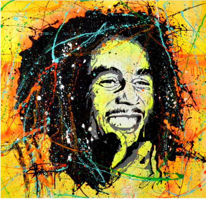
Title: Be Happy bob Painting : Water Acrylic & Oil Acrylic on Canvas Year: 2016 Measures: 39 x 39 in. SOLD