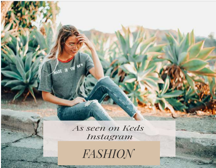
As seen on Keds Instagram