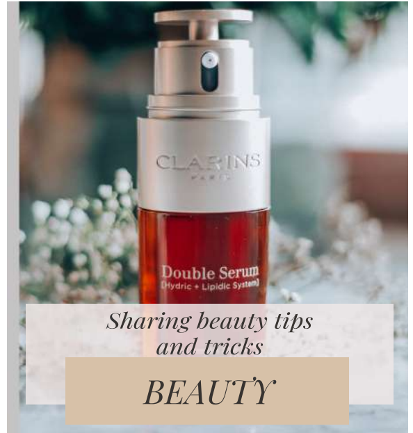
Sharing beauty tips and tricks