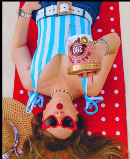
HALO TOP CREAMY