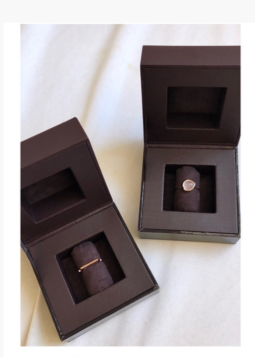
The details are on point. Obsessed with my new Siren Stacking Rings ♥ Use my code US20RAFINSIDER-4F29 to receive 20% off purchases. Link in bio.