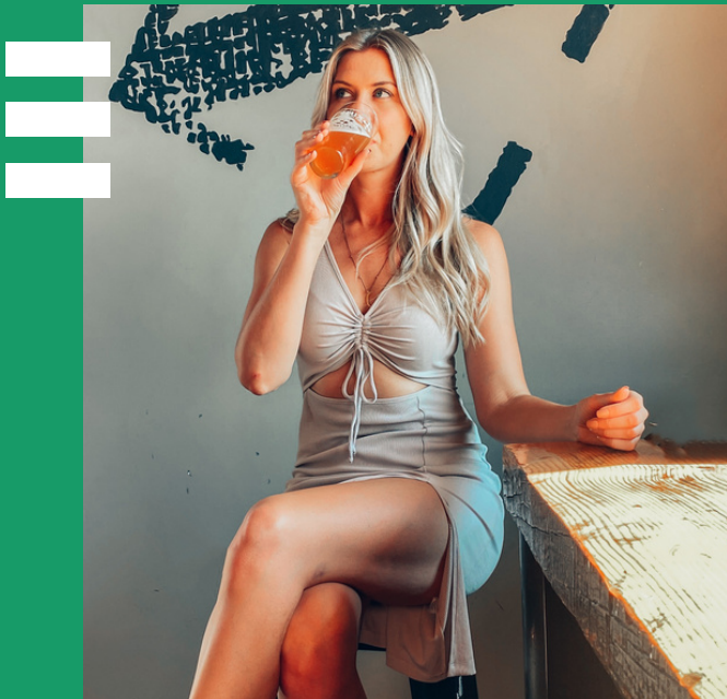
Campaign for Visit Bend