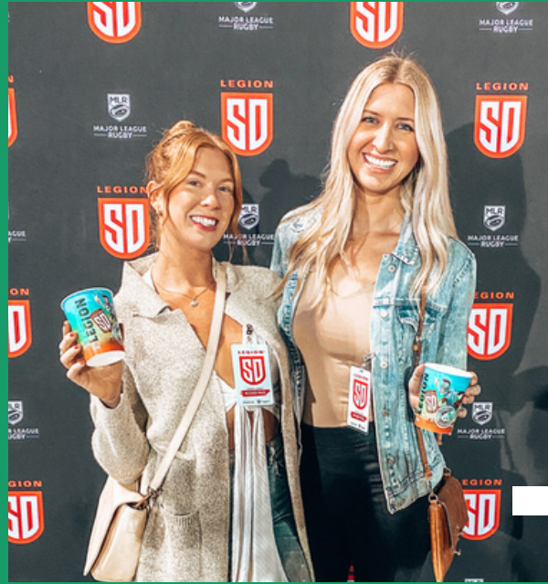
Campaign for SD Legion