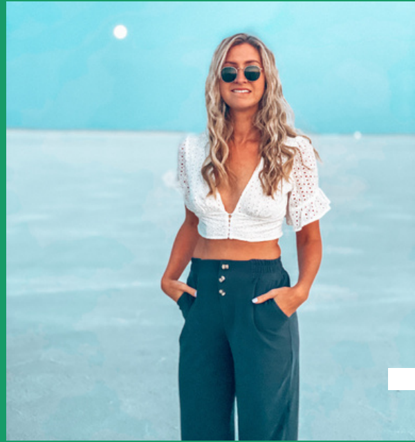
Campaign for Ariose Co.