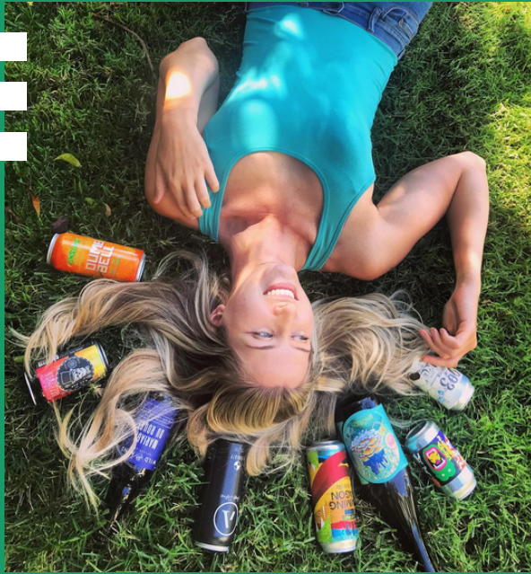
Campaign for Tavour