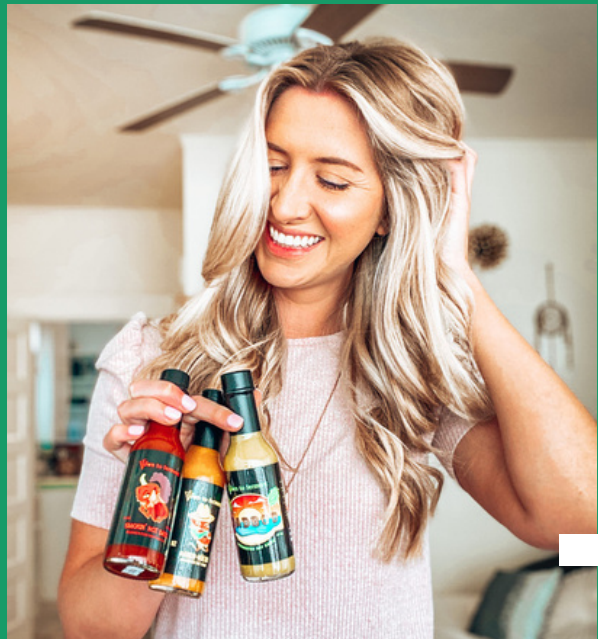
Campaign for Down To Ferment