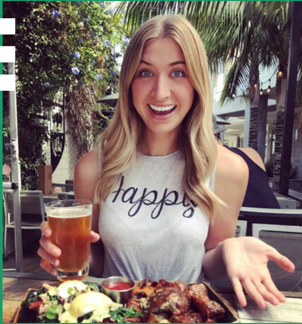
Campaign for Bier Garden