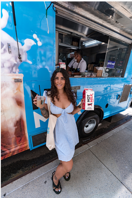
NOT MILK CO. BRAND COLLAB (NYC) Videography, photography, feed post, Instagram stories.