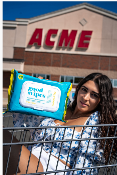
GOOD WIPES X ACME BRAND COLLAB (NYC) IG feed post, photography, and stories