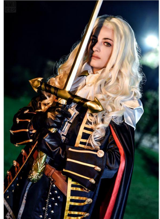
Alucard - Castlevania SoTN

She has participated in most of the major competitions since 2012. Among the most important awards she has won, there was a second place in ECG selections, a second place in the Eurocosplay selections, ICC selection, Best Female at Comicon, Best Female and Best Interpretation respectively at Salerno Comicon and Cavacon, plus a number of minor awards.