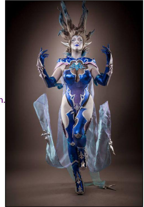
Shiva- Final Fantasy XIV

As guest she visited many foreign countries like: Austria, Slovakia, France, Belgium, Poland, Ireland and many others.