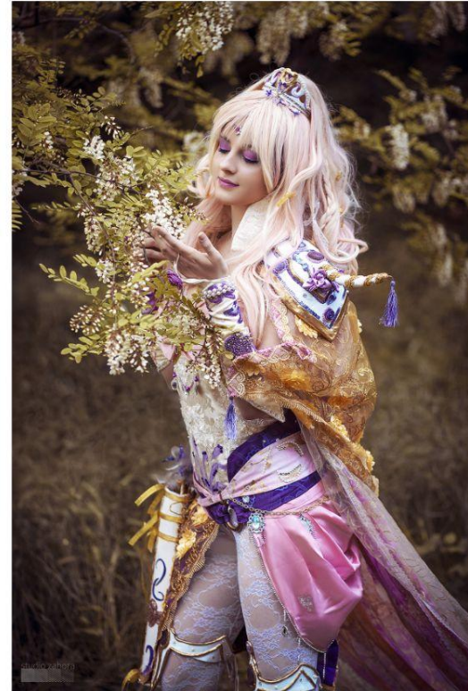
Rosa - Final Fantasy IV

I would like to thank you again for your time.