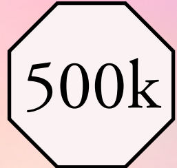
30 Day Reach